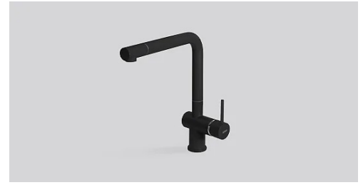
Photograph is for information purposes only. May not correspond to the selected version

Packaging dimensions L 485 x H 90 x P 250 mm