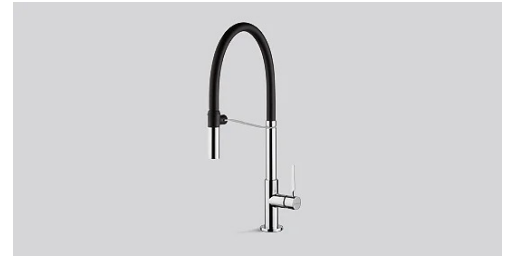
Photograph is for information purposes only. May not correspond to the selected version

Packaging dimensions L 350 x H 80 x P 580 mm